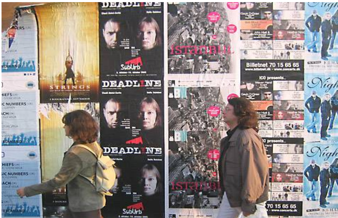
Plate 4.2 SUPERFLEX & Jens Haaning. 1000 Istanbul Biennial Posters (detail), 2005.