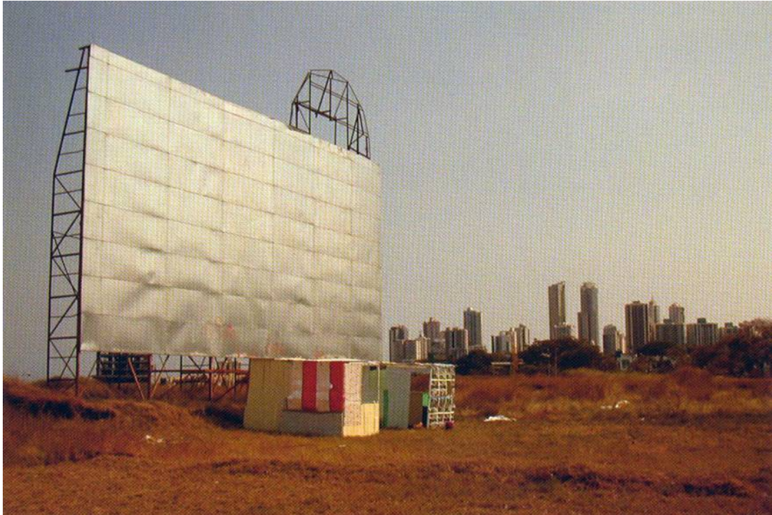
Plate 2.1 Jesús Palomino. Vendors and Squatters (detail), 2003.