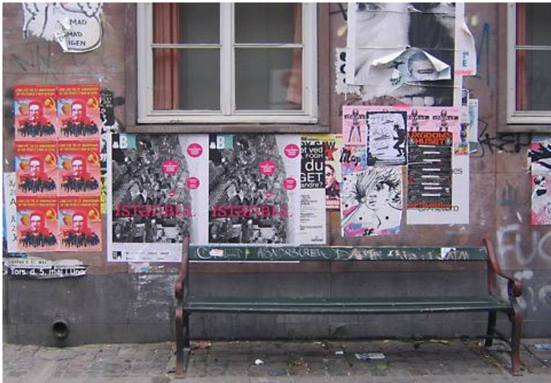
Plate 4.1 SUPERFLEX & Jens Haaning. 1000 Istanbul Biennial Posters (detail), 2005.