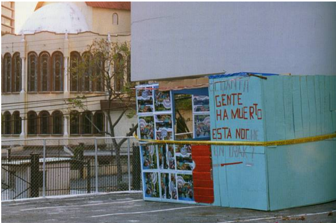
Plate 2.2 Jesús Palomino. Vendors and Squatters (detail), 2003.