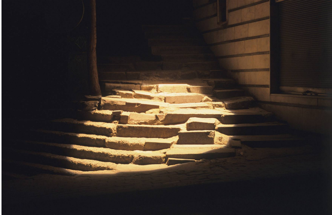
Plate 3.2 Karl-Heinz Klopff. Mind the Steps (detail), 2005.